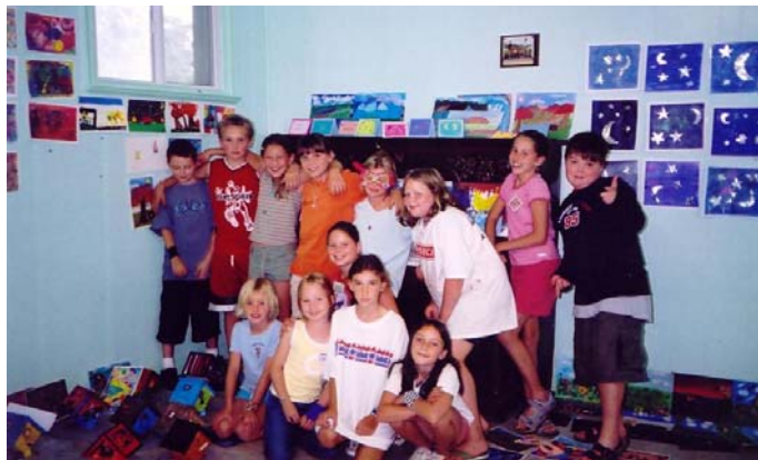
Happy Campers and their artistic endeavours on display

Students completed projects such as mobiles, wood crafts, and painting with a variety of mediums.