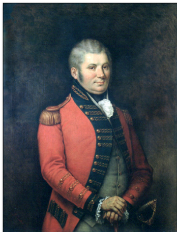
Colonel John Graves Simcoe, [ca. 1881] Lieutenant Governor of Upper Canada, 1791-96 George Theodore Berthon (1806-1892) Oil on canvas, 109.2 cm x 83.8 cm (43" x 33") Government of Ontario Art Collection, 694156