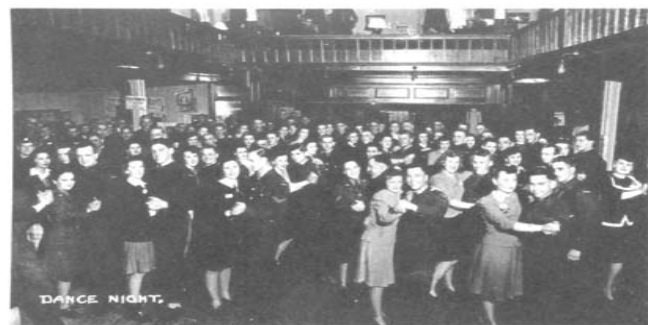
June 1, 1942—Maple Leaf Club Dance Night